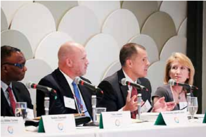
Judge Pena makes a point at the 2017 Leadership Roundtable, "Is Justice Blind? Racial Disparities in the Criminal Justice System"