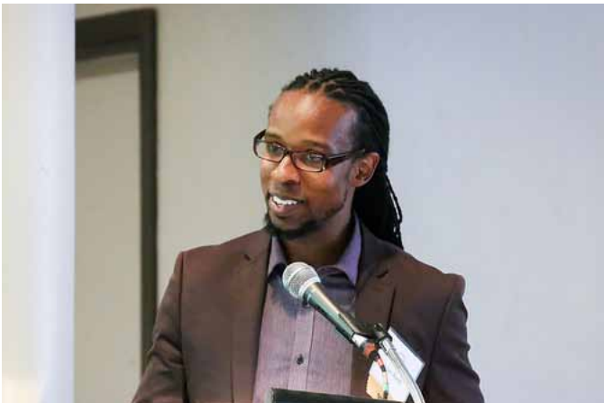
Luncheon Speaker and Panelist Ibram X. Kendi, Author of Stamped From the Beginning: The Definitive History of Racist Ideas in America