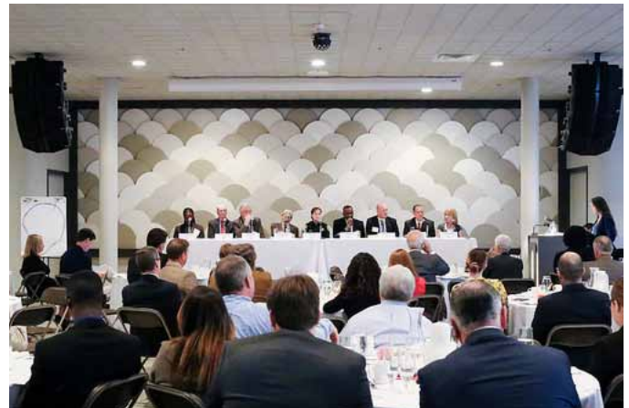
Panelists and attendees at the 2017 Leadership Roundtable on April 20, 2017